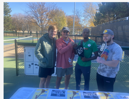
(WT students preparing to compete during CMC's Pickle Ball Tournament)